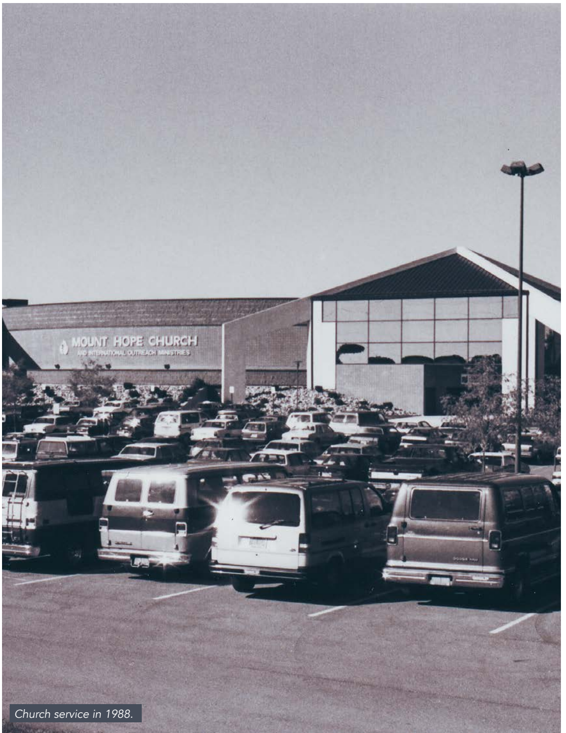
Church service in 1988.